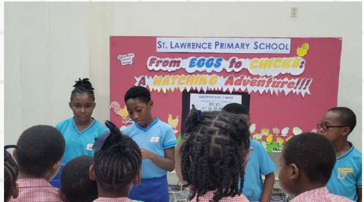
Students of Class 3 explaining the process from eggs to chicks to their attentive student audience.

This term the students of Class 3 embarked on a Science project to trace the journey from eggs to chicks . They shared some fun facts that they learnt from this project. Look below and ask yourself, how many did you know?