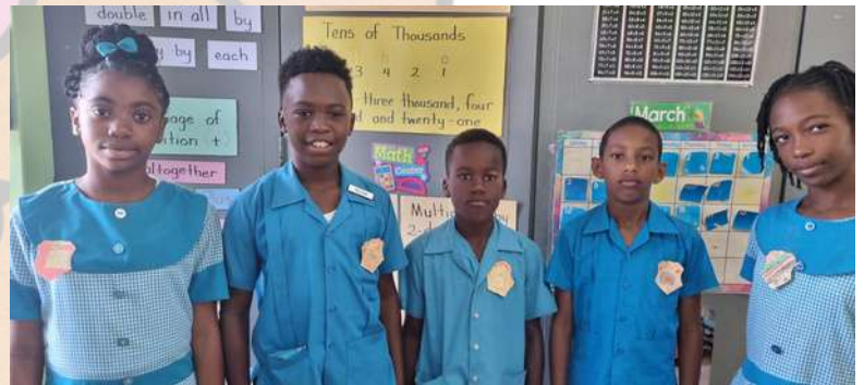
Some of the 'Peace Police' at St. Lawrence Primary School who emulate, encourage and enforce peace.

This term the Ministry of Education embarked on a Peace Initiative Program. We at St Lawrence Primary School embraced this initiative and focused heavily on promoting peace among our students.