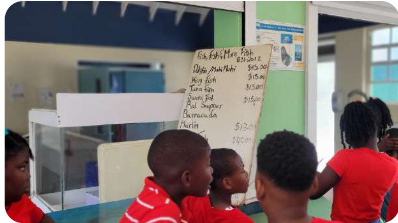
Payne's Bay Fish Market

International Day of Mathematics or Pi Day is celebrated on March 14 (3.14) each year. The theme this year was "Mathematics for Everyone" . With the knowledge that everyone has mathematical ability but to varying extents and degrees, the school engaged in a Mathematics Journey. The students interacted with the natural environment and people to understand how mathematics is used in everyday life, outside of the classroom and to observe how mathematics is used daily, in simple ways.