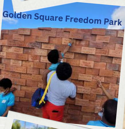
Golden Square Freedom Park