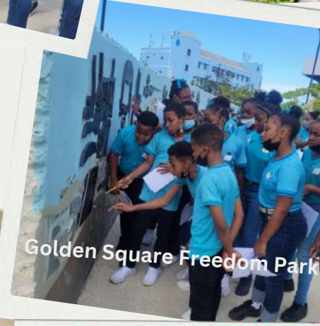
Golden Square Freedom Park