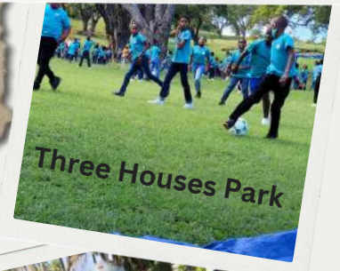
Three Houses Park